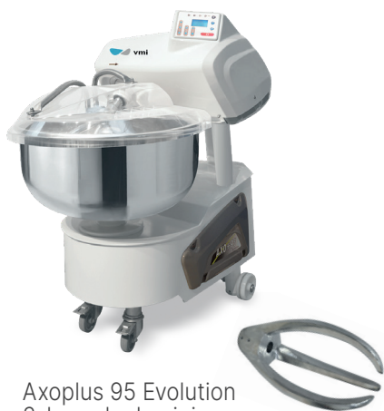
Axoplus 95 Evolution 3-branch aluminium arm